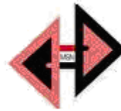
Malaysian Society of Nephrology